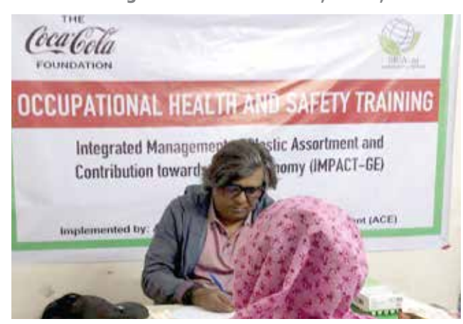
Free health consultations were given to the participants in the Occupational Health and Safety training