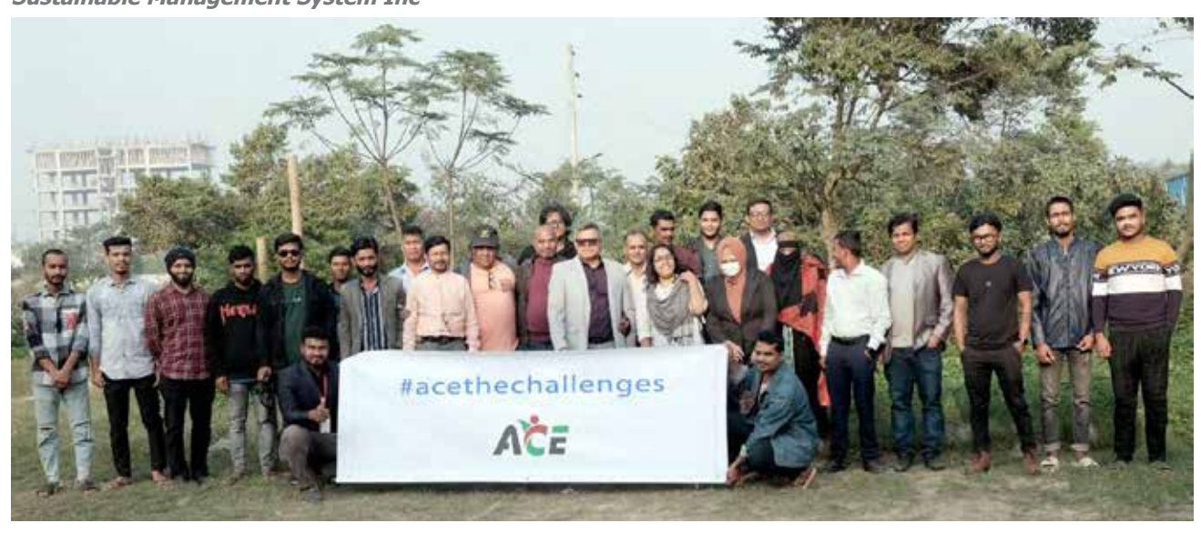
Snapshot of the annual get-together of ACE and its project staff