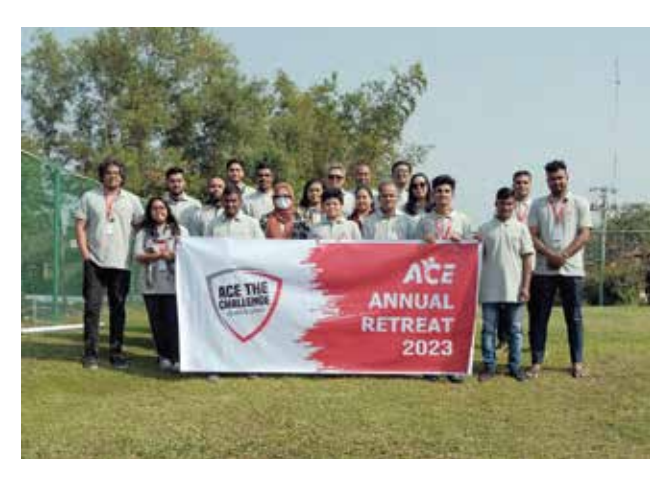
Group photo- A snapshot of the ACE family in the annual retreat