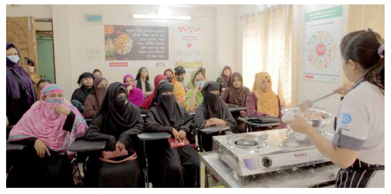
A snapshot of healthy cooking training among the RMG Factory workers and Community members at the Community Kitchen

Our Nutrition Trainer provided basic nutrition training among the workers of partner factories, organized community counseling sessions, and demonstrated that there are needs and benefits for both workers and management for nutritional education and nutritional food provision in factories. A formal meal plan including wages that provide means of buying nutritious and safe food, fortified foods and nutrition supplements, storing homemade food safely, and a clean dining room can significantly improve workers morale, reduce absenteeism, and increase productivity.