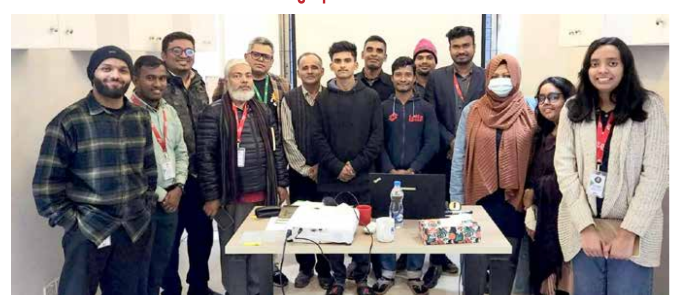
Capacity-building training on organizational policies and management for ACE team members