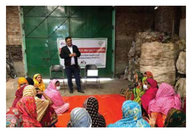
Occupational Health and Safety Training given to the plastic waste collectors under the IMPACT-GE project