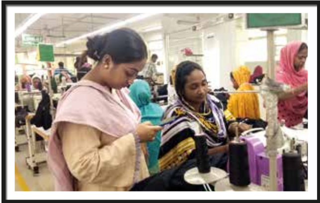
Baseline Survey with the female workers at the partner factory