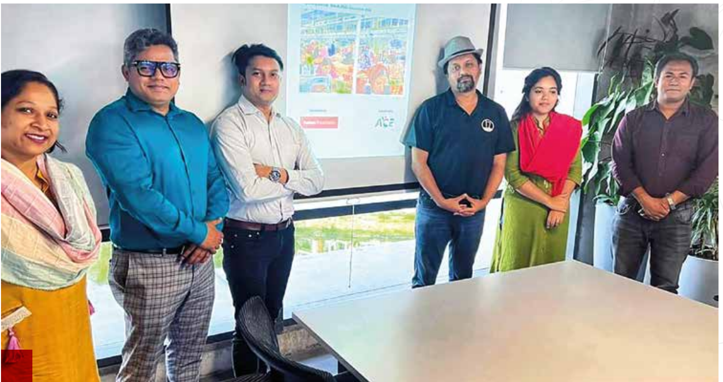
Annapurna Project Mid-term Progress learning and sharing Meeting