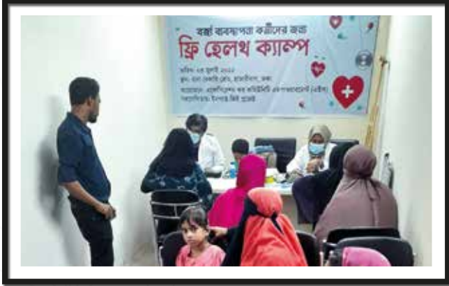
Free Health Camp At Hazaribagh conducted by ACE