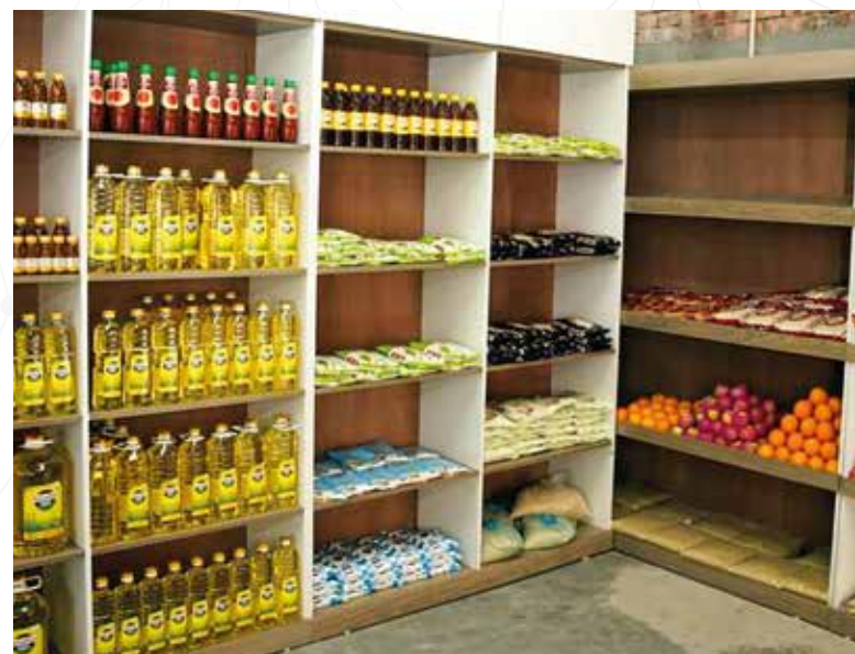
Inner view of Fair Price Shop at Teen Age Modern Fashion Ltd

After the completion of the project period, if not extended, ACE aims to continue their efforts. The Auchan Foundation has created this opportunity and extending their hands to the RMG workers in Bangladesh.