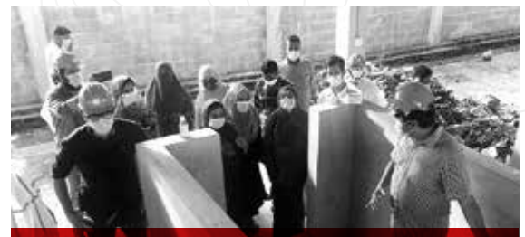
Training on Compost Processing and Waste Management at Jainkathi Co-Compost Plant, Patuakhali