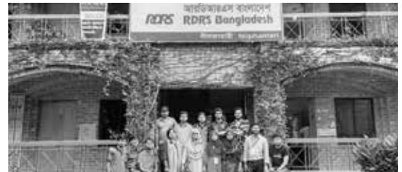
ACE - Research Team to conduct End Evaluation Research of "RDRS - Core Comprehensive Program" at Rangpur division