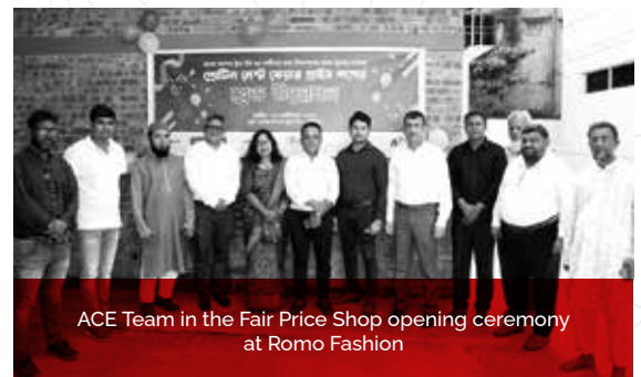
ACE Team in the Fair Price Shop opening ceremony at Romo Fashion