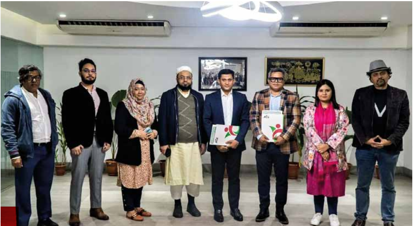
MoU Signing with Enam Medical College Hospital