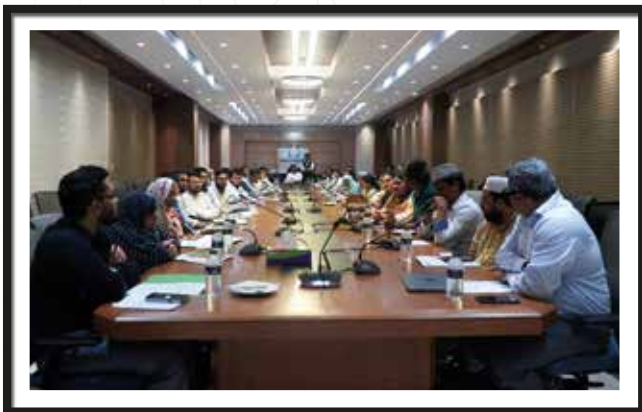
First Dissemination Workshop On Diabetes And Smoking Cessation (DISC)