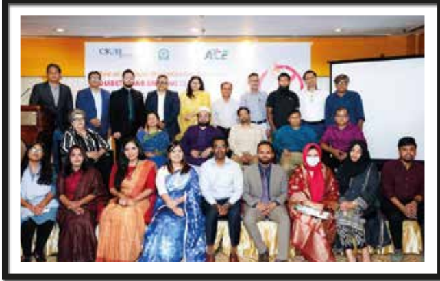
End-of-protocol Dissemination Workshop On Diabetes And Smoking Cessation (Disc)