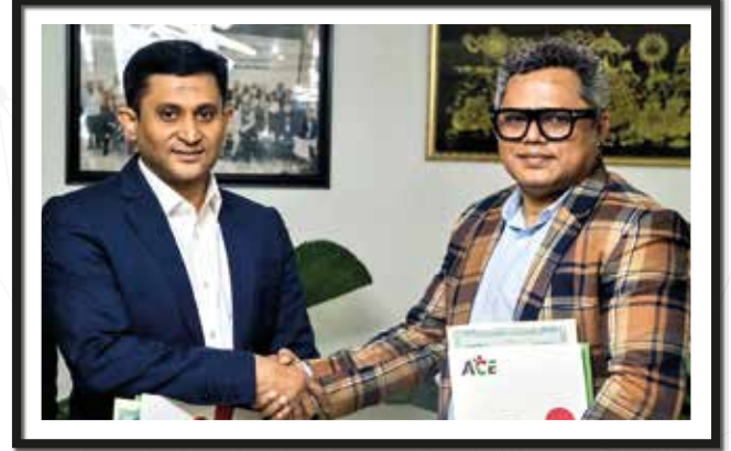
On the day on MoU Signing ceremony with Enam Medical College