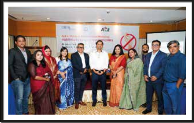
Our ACE Team on End-of-protocol Dissemination Workshop On Diabetes And Smoking Cessation (Disc)