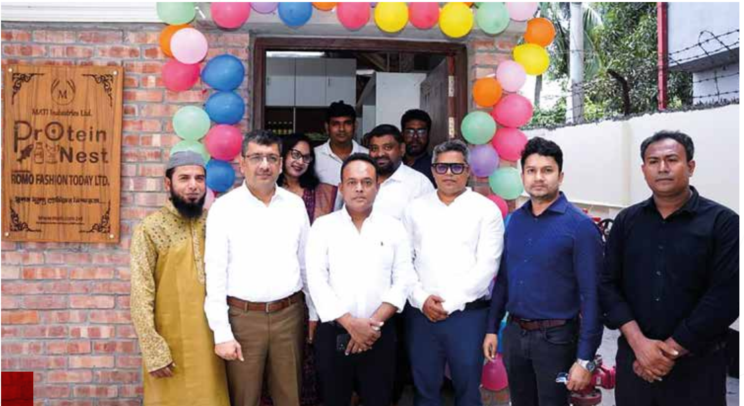
Fair Price Shop Opening