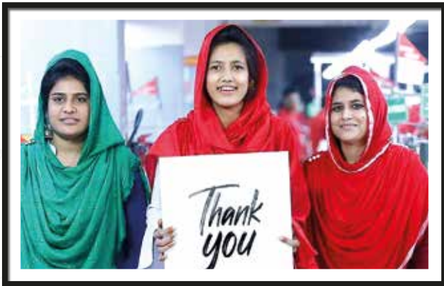
Visiting the female workers of the factory